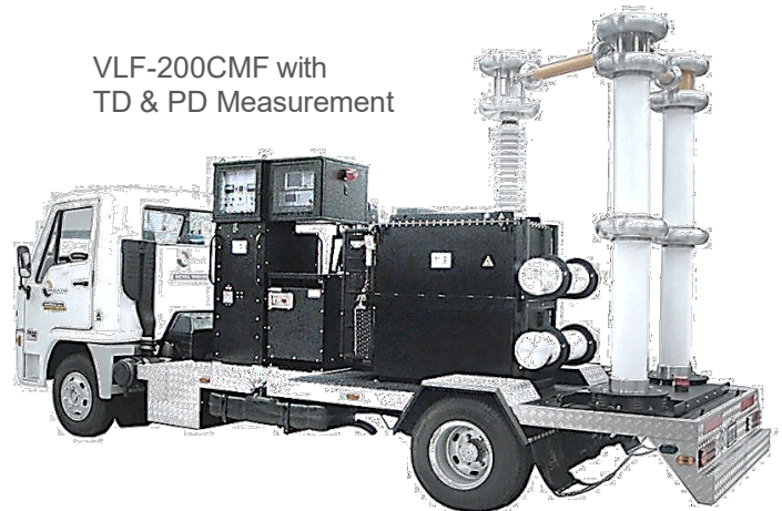
VLF-200CMF with TD & PD Measurement

Includes VLF-200CMF 10 kW Generator, Noise Filter, TD & PD Measurement Divider, & TD & PD measurement & reporting Instrumentation.