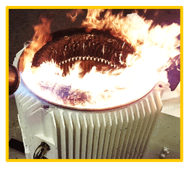
Maybe Not That Much

Burn it! If there is a fault in a winding or some other load, sometimes it has to "burned" to find it. Under normal operation, most hipots will overload, or "trip" off when an arc occurs on the output. This indicates that a failure has occurred and protects the load from further damage by the removal of the high voltage and the resultant current draw through the load. However, in some cases it is desirable to allow the high voltage to remain on to sustain the arc for the purpose of "burning" the defect to make it worse. This is done to make the location of the fault more obvious and easier to find.